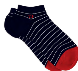
SRF04 Navy, white striped