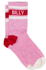
FTE04 Pink and red