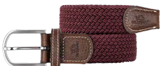
CM91 Wine red