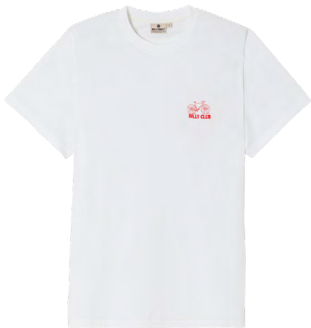
TSV05 White, bicycle embroidery