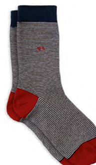
RA07 The 33