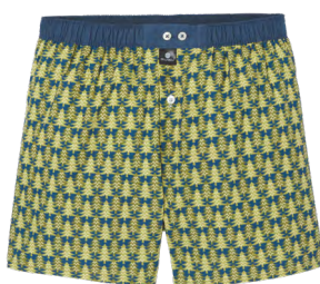
CA102 Pine forest