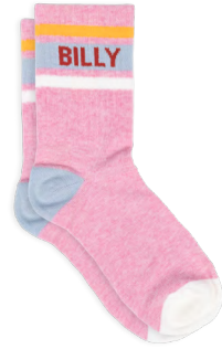
FTE09 Pink and grey