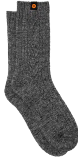
W006 Mottled grey