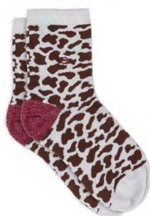
FFL37 Cow, brown and beige