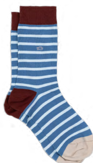
RL43 Blue, sky blue striped