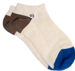
SUF02 Mottled beige