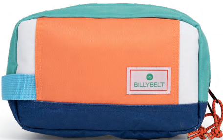
TDT12 Orange and green