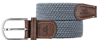
CM88 Cold grey