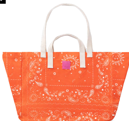
CAB02 Bandana print, orange