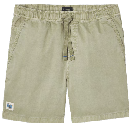
SHC03 Anise green