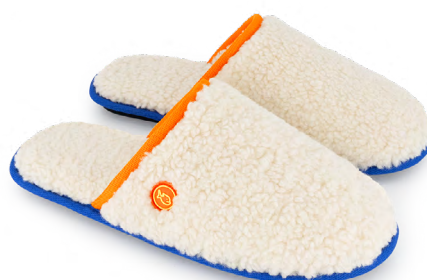
MUL08 White sherpa