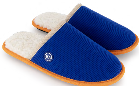
MUL05 Electric blue velvet