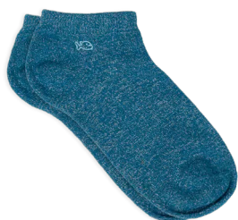
SP20 Duck blue