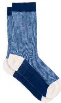
CH38 Marine mist