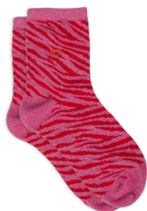
FFL31 Zebra, red and pink