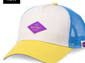
CAT01 Ecru and blue