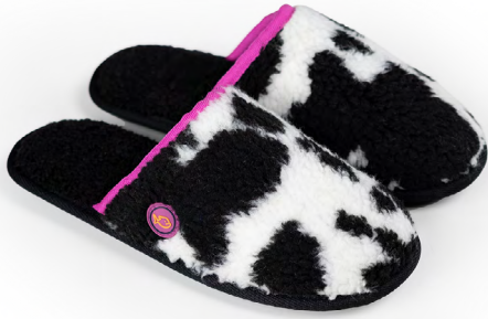
MUL14 Cow sherpa