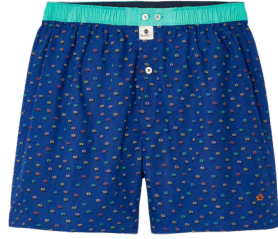
CA97 Billy pop