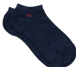
SU14 Dark blue