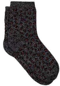
FFL01 Leopard, black