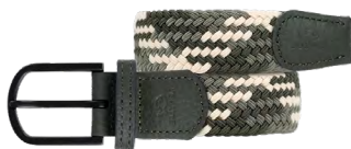
CB141 Amazonia 2