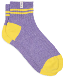
CMH03 Purple, yellow striped