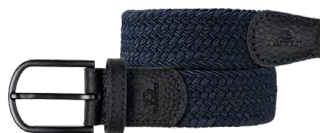
CM68 Deep water