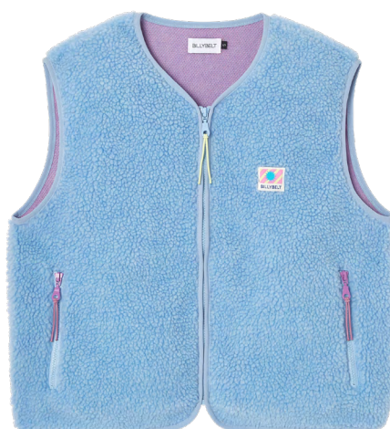
SHE43 Light blue