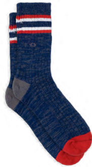
CL46 St Andrews