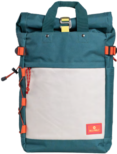
SAD34 Green and ivory