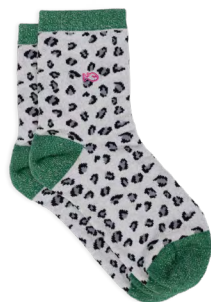
FFL29 Leopard, white and green