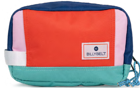
TDT13 Red and blue