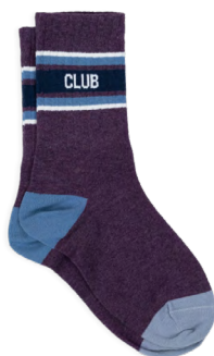
TE28 Purple, blue and white striped