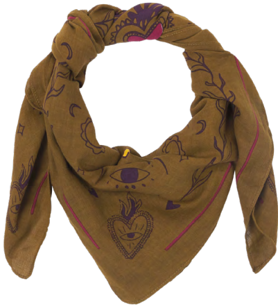
WFC11 Lise - Khaki