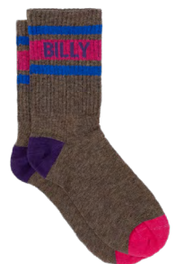
FTE02 Brown and pink