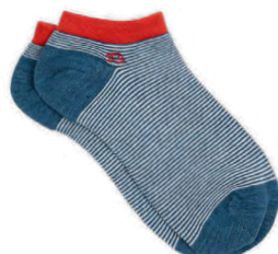
SR22 Blue, white striped