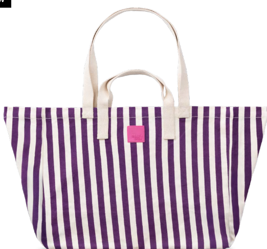
CAB01 Striped, purple and ecru