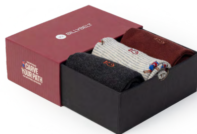
CCH02 Carve your path