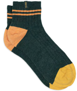
CMH04 Green, orange striped