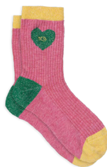
FC11 Pink and green