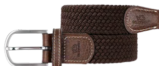
CM09 Brown leaf