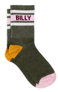
FTE06 Green and pink