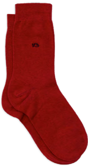
U07 Red pomegranate