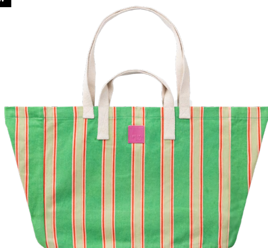
CAB05 Striped, green