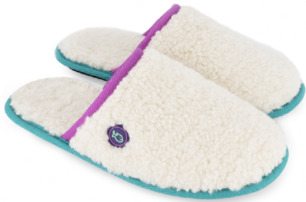
MUL09 White sherpa