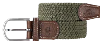
CM43 Green army