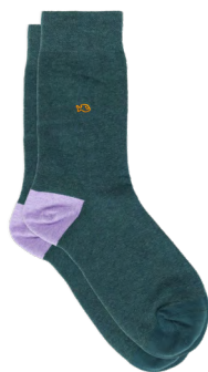
UF13 Mottled green