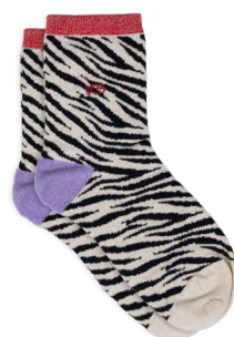
FFL36 Zebra, black and beige