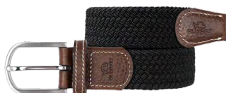
CM11 Black licorice