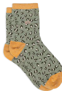
FFL23 Leopard, light green and orange