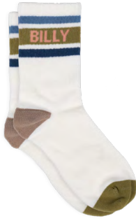
FTE11 Ecru and khaki