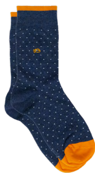
FA68 Starry night