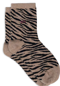
FFL32 Zebra, black and brown