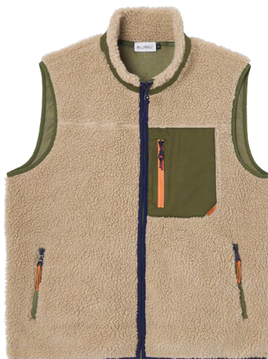
SHE45 Natural and khaki