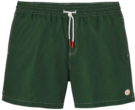
MDB18 Deep lagoon