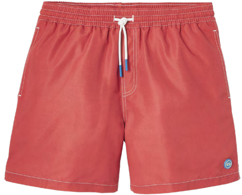
MDB17 Coral vibe