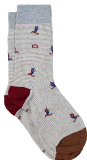
CHL41 Red pist