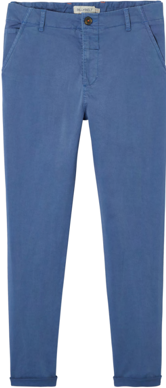
CH104 Ice blue