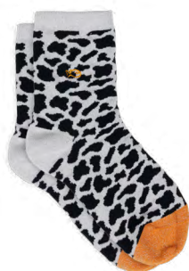
FFL38 Cow, black and white