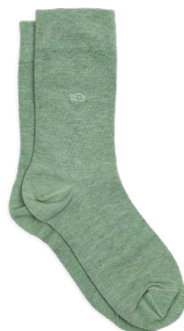
CBA04 Mottled light green