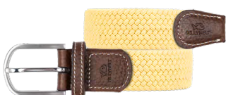
CM86 Topaz yellow