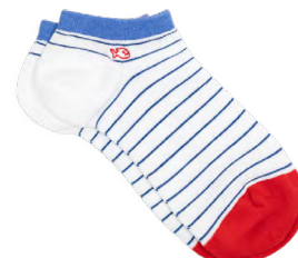
SRF08 White, blue striped