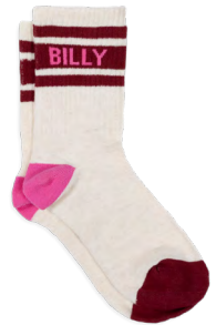
FTE05 Ecru and burgundy