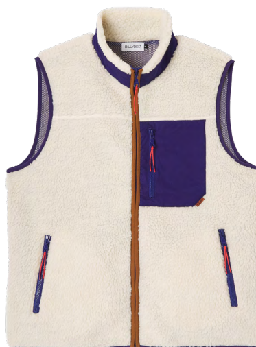
SHE47 Ivory and navy