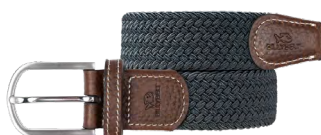
CM06 Flannel grey