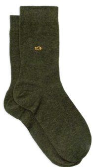
U31 Dark khaki