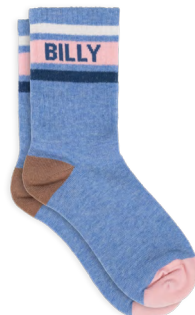
FTE07 Blue and pink