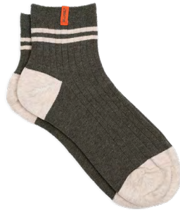
CMH06 Khaki, beige striped