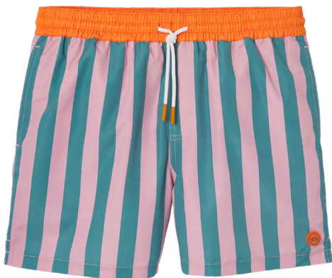
MDB14 Sunset avenue