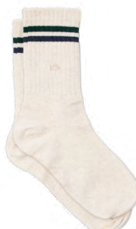
TE07 Beige, green and black striped