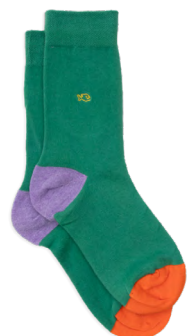
UF01 Mottled green