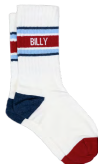
TE27 White, red and blue striped