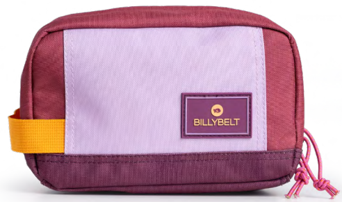
TDT15 Purple and burgundy