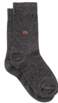
U03 Mouse grey