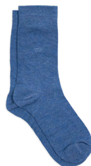
CBA07 Mottled blue jean