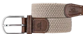
CM02 Sandy beige