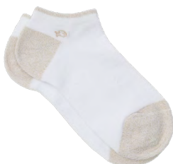
SP10 White and gold