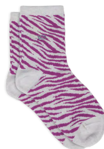
FFL33 Zebra, purple and white