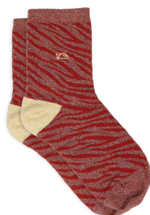
FFL34 Zebra, burgundy and light burgundy