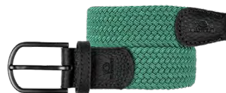
CM96 Emerald green