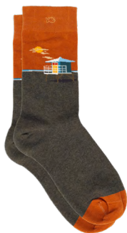
CHL47 San Diego