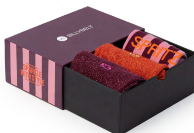
CCFO2 Sparkle with style