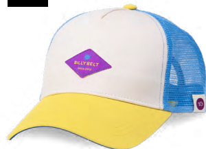
CTK01 Ecru and blue