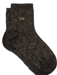
CP08 Mineral black