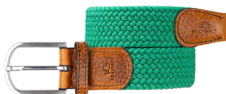
CM78 Golf green