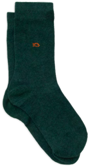
U27 English green