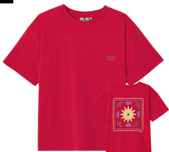
TSW06 Red, sun print