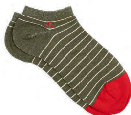
SRF06 Khaki, beige striped