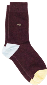
UF16 Mottled burgundy