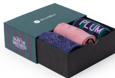
CCFO4 Enjoy the sweetness