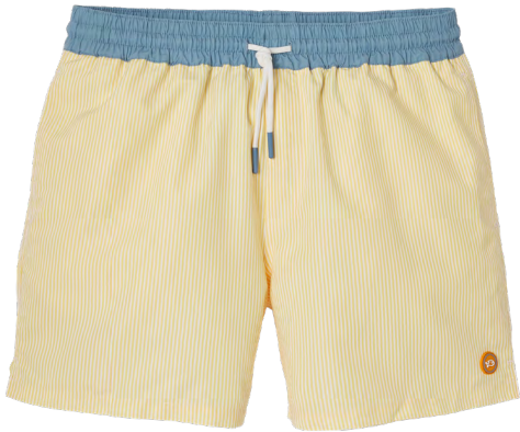
MDB12 Miami bloom