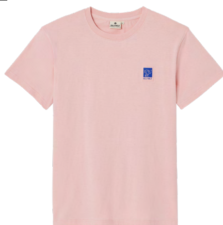
TSB05 Pink, BILLY embroidery