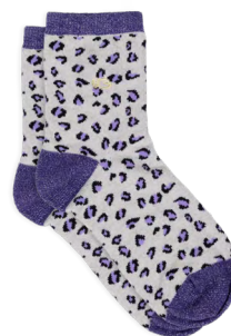
FFL26 Leopard, beige and purple