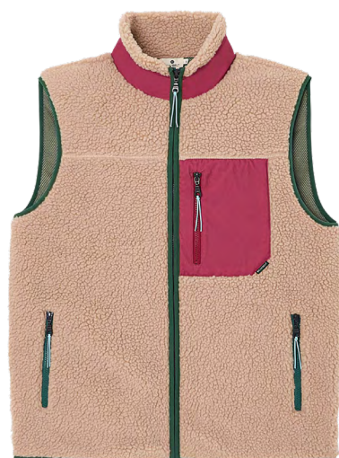
SHE36 Natural et burgundy