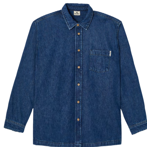
SD02 Denim stone