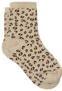
FFL03 Leopard, beige