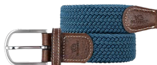
CM90 Seram blue