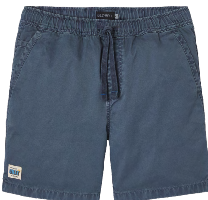
SHC01 Denim blue