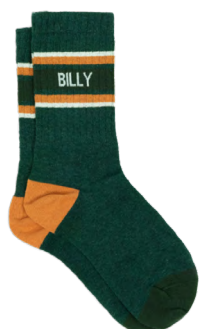
TE26 Green, orange and white striped