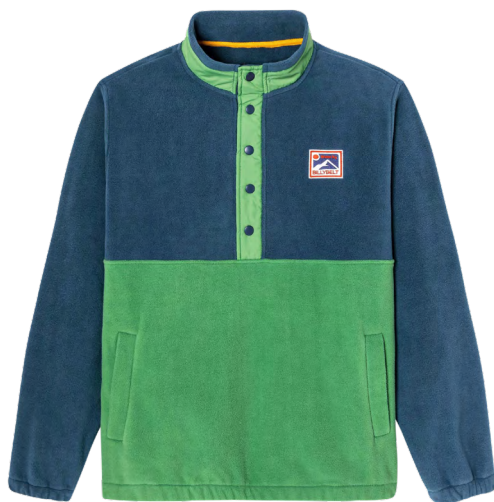
POLO4 Navy and green