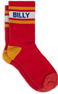
FTE10 Red and ecru