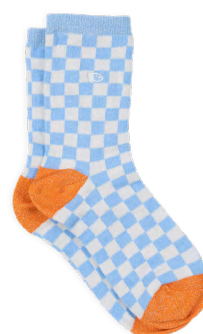
FM018 Beige and light blue