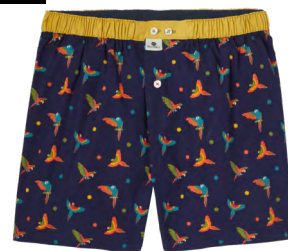
CA112 Coco loco