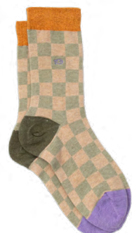
KR001 Beach race