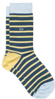
RL47 Petrol blue, yellow striped