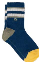
CRG01 Bleu, khaki and white striped