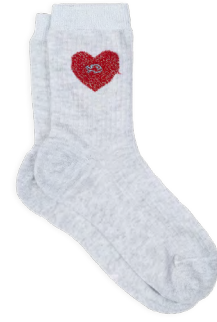
FC13 White and red