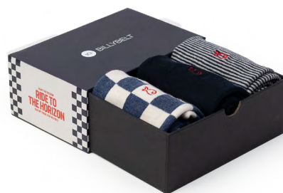
CCH01 Ride to the horizon