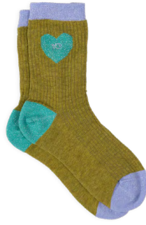
FC14 Olive and turquoise