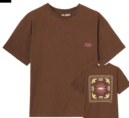
TSW05 Brown, sun print