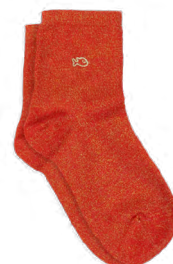
CP26 Blood orange