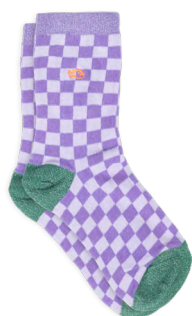
FM029 Purple and light purple