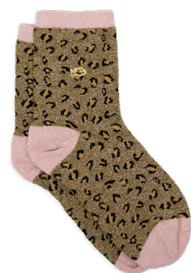
FFL17 Leopard, olive green