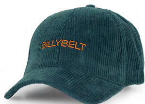
CAV09 Dark green