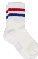
CRG02 White, blue and red striped