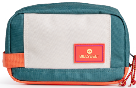
TDT16 Green and ivory