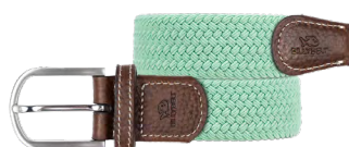
CM83 Aqua green