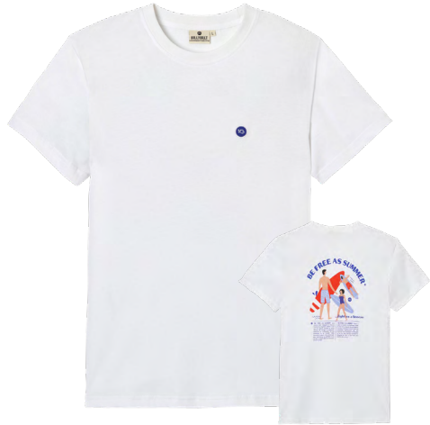
TSV08 White, surfer print