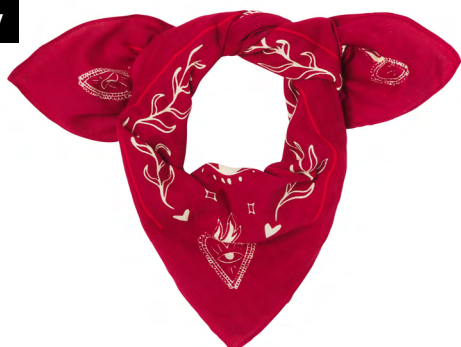
WBC01 Lise - Red