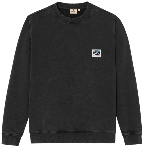
SWE02 Dark grey