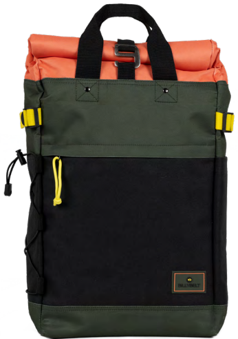
SAD28 Black and khaki