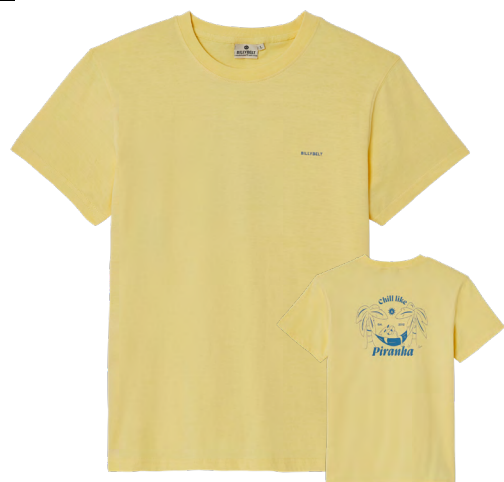
TSB06 Yellow, «Chill like a piranha» print