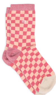
FM026 Pink and peach