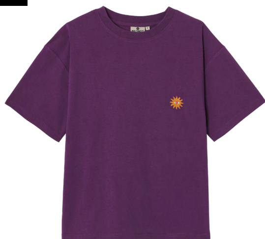
TSW02 Purple, sun embroidery