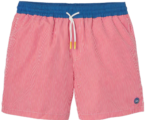
MDB11 Red riviera