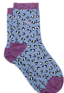
FFL16 Leopard, blue