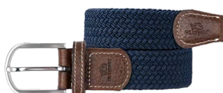
CM03 Slate blue