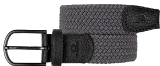
CM98 Anthracite grey