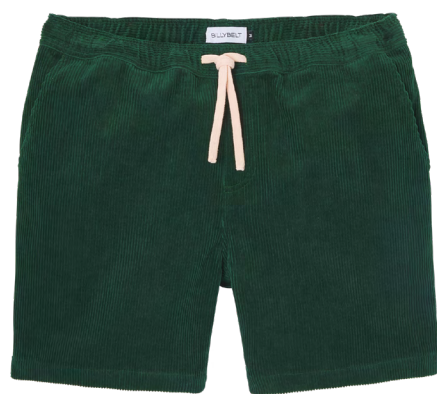
SHV13 Dark green