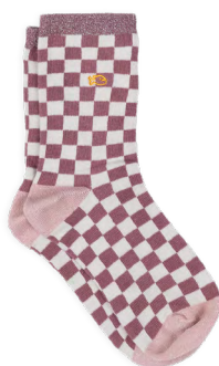
FM017 Ecru and dusty pink