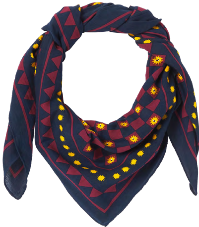
WFC10 Romane - Navy