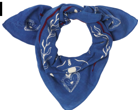
WBC02 Lise - Blue