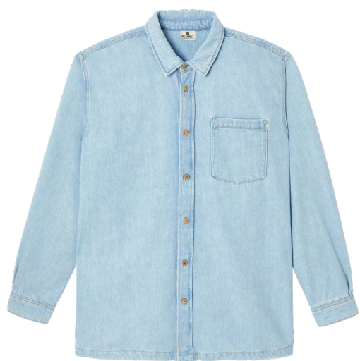
SD01 Denim bleach