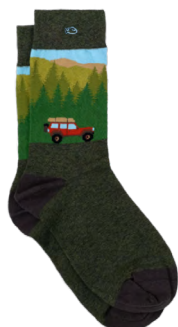
CHL36 Road trip