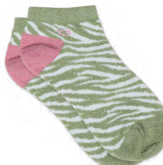
SFW19 Zebra, green and white