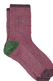
FPA18 Old pink