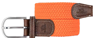
CM95 Ercolano orange