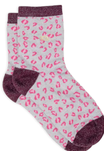
FFL24 Leopard, ecru and wine red