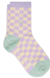
CKF03 Purple and pale yellow