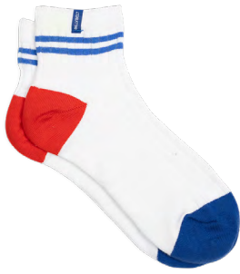
CMH07 White, blue striped*