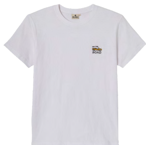
TSR05 White, Mehari embroidery