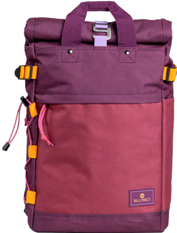
SAD33 Purple and burgundy