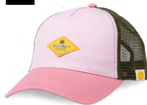
CTK02 Pink and green