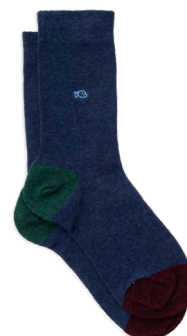
UF02 Mottled navy