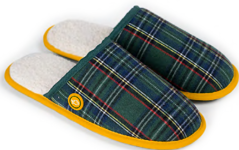
MUL12 Green checks