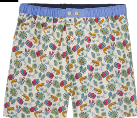
CA108 Dolce vita