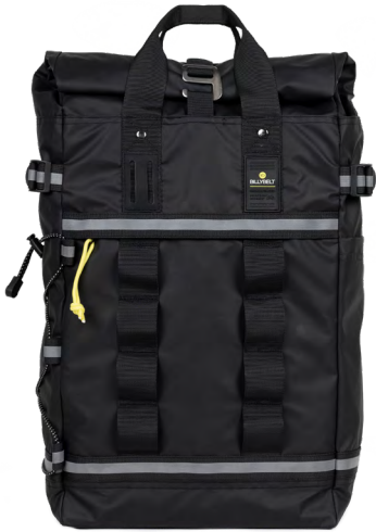
SAD30 Black waterproof