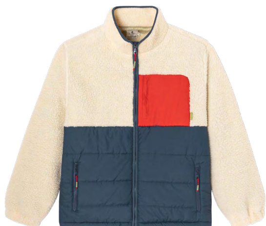
SHE26 Ivory and navy