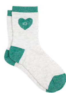
FC09 White and green