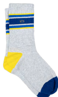
TE25 Grey, blue and yellow striped