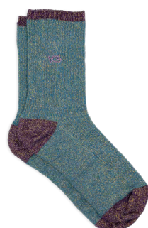
FPA17 Duck blue