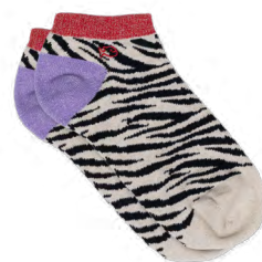
SFW20 Zebra, black and beige