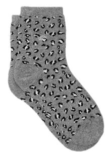
FFL13 Leopard, grey