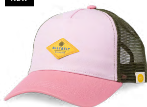
CAT02 Pink and green