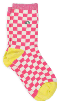
FM016 Pink and white