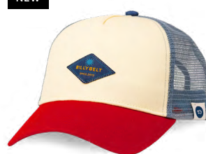
CAT04 Yellow and green