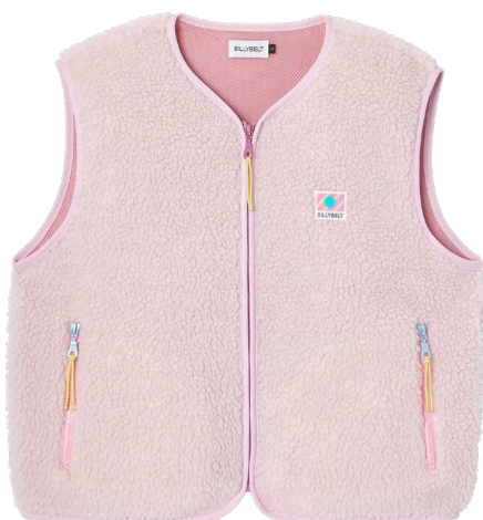
SHE44 Light pink