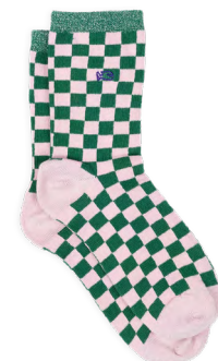
FM015 Green and pink