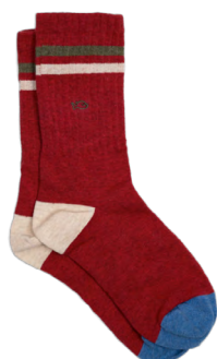
TE21 Red, green and beige striped