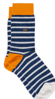
RL45 Blue, grey striped