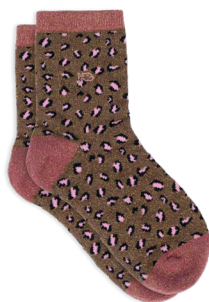
FFL27 Leopard, brown and old pink