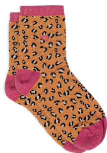
FFL30 Leopard, orange and pink