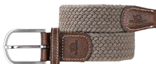
CM24 Taupe beige