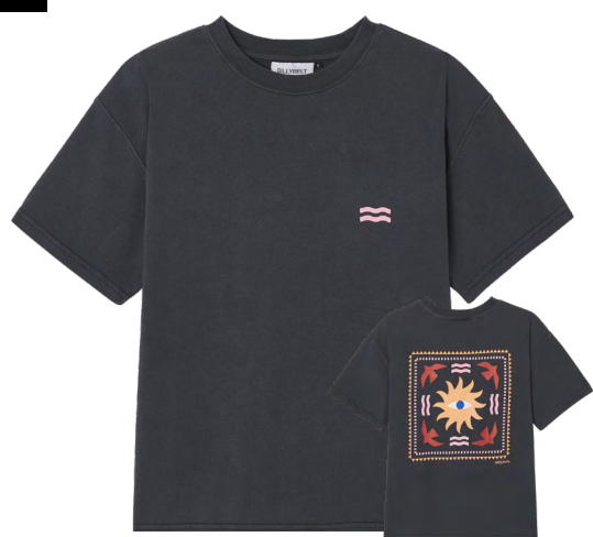
TSW04 Anthracite, sun print