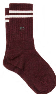
TE08 Burgundy, beige striped