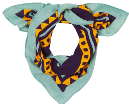
WBC04 Paola - Purple