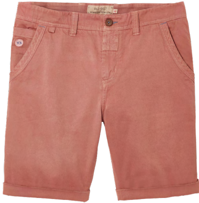
SH009 Salmon pink