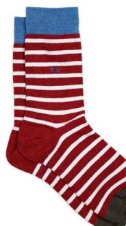
RL34 Red, white striped