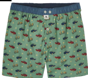
CA113 Summer ride