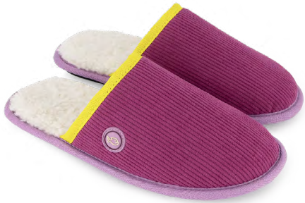
MUL07 Pink velvet