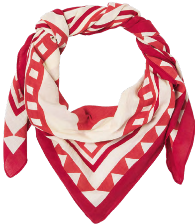
WFC09 Paola - Ecru