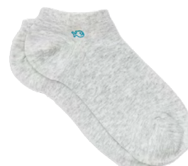
SU10 Mottled light grey