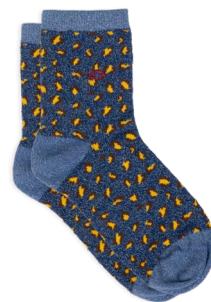
FFL28 Leopard, navy and blue