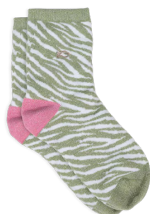
FFL35 Zebra, green and white