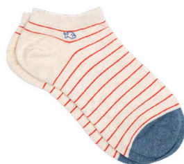
SRF05 Beige, red striped