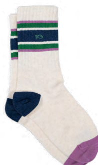
TE24 Beige, green and purple striped