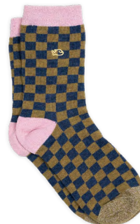
FM001 Khaki and blue