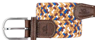
CB162 Cape Town