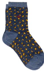
CLF02 Leopard, navy and yellow