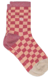
CKF02 Pink and peach