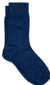
CBA05 Mottled blue