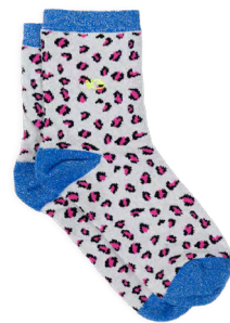
FFL21 Leopard, white and blue