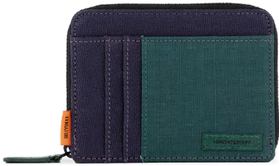
PM04 Navy and green