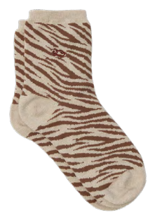
FFL10 Zebra, beige and brown