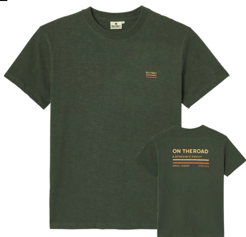
TSR07 Khaki, «On the road» print