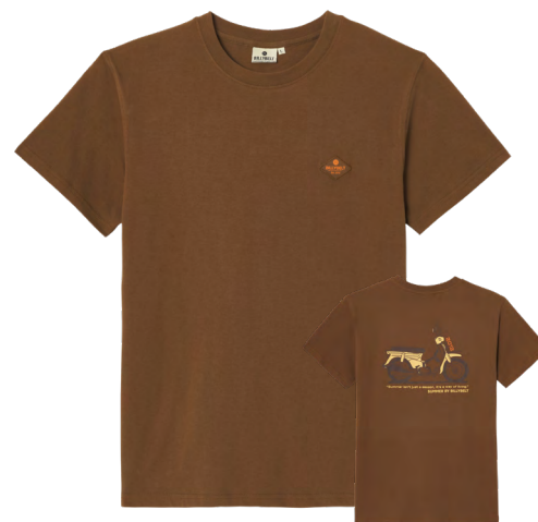
TSR04 Brown, scooter embroidery