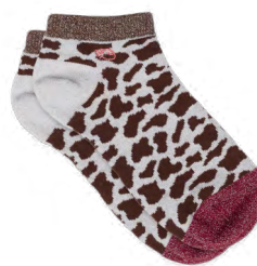
SFW22 Cow, brown and beige