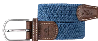
CM01 Air force blue