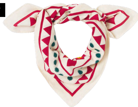
WBC05 Romane - Ecru