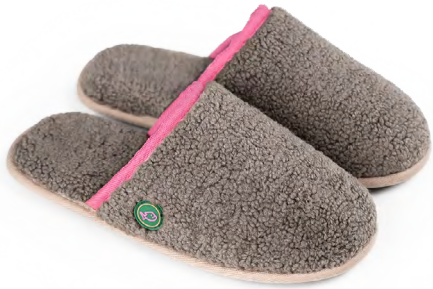
MUL13 Brown sherpa