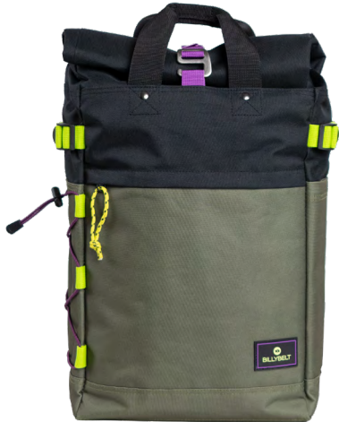
SAD32 Khaki and black