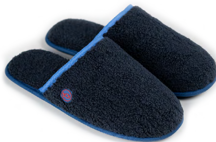
MUL11 Navy sherpa