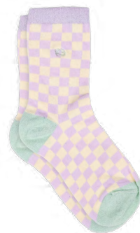
FM027 Purple and pale yellow