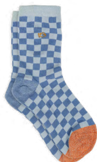
FM028 Blue and sky blue