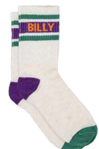
FTE01 Ecru and purple