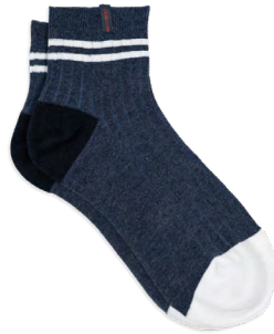
CMH01 Navy, white striped