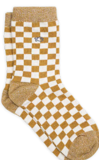
FM004 Yellow and white