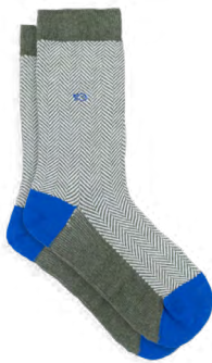
CH36 Forest flash