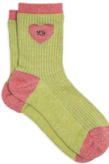
FC07 Olive green and pink