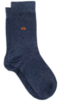
U10 Mottled blue