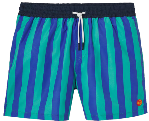
MDB13 Ocean drive