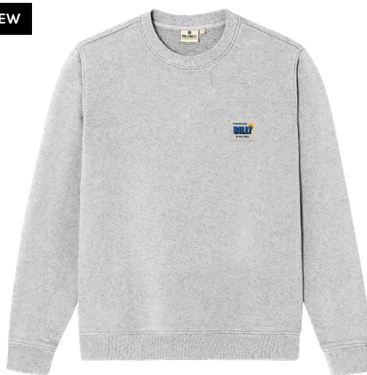
SWV07 Mottled light grey