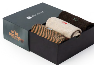
CCH04 Off the beaten path