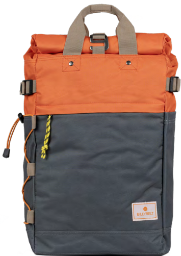
SAD24 Slate and orange