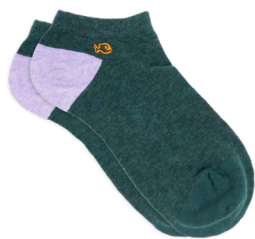
SUF03 Mottled green