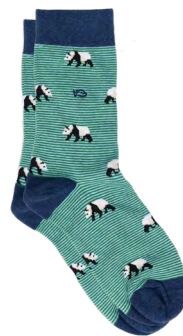
CHA36 White panda