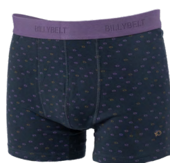
B086 Billy purple