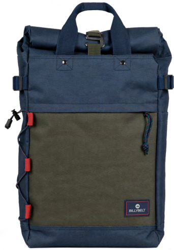
SAD27 Khaki and navy