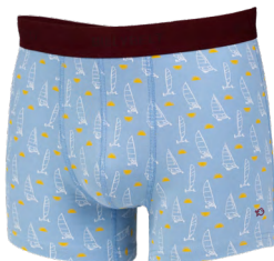
B092 Land sailer