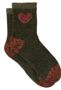
FC01 Khaki and burgundy