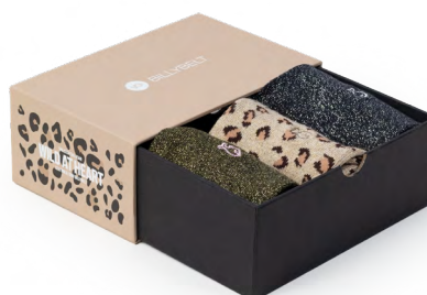
CCFO1 Wild at heart