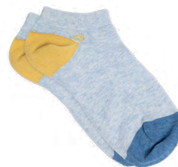
SUF01 Mottled sky blue