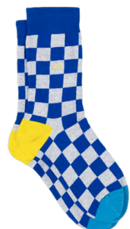
KR011 Marina Bay