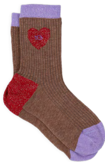
FC12 Brown and red