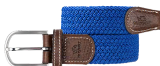
CM79 Greek blue