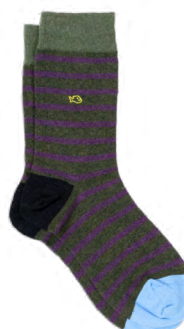
RL41 Mottled green, purple striped