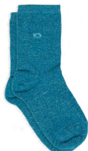
CP33 Duck blue