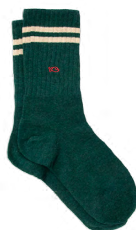
TE03 Duck green, beige striped