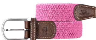
CM81 Pink magenta