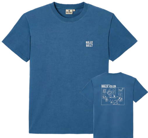
TSV06 Blue, BILLYCLUB print