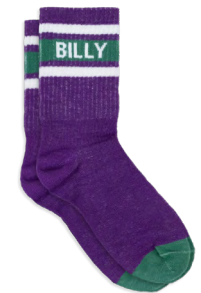
FTE03 Purple and green