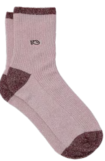
FPA04 Light pink