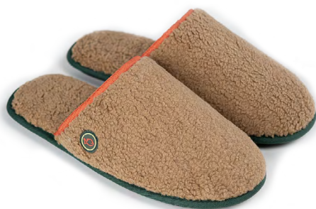
MUL10 Camel sherpa