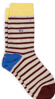
RL40 Beige, burgundy striped