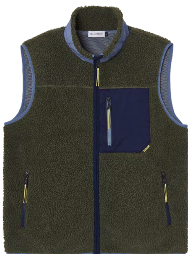
SHE48 Khaki and navy