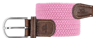
CM87 Misty pink