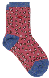
CLF03 Leopard, red and blue