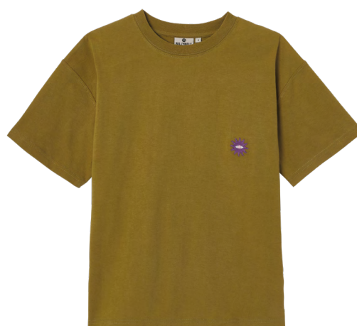
TSW03 Olive, sun embroidery