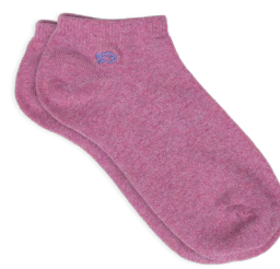
SP18 Pale pink