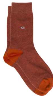
UF14 Mottled red