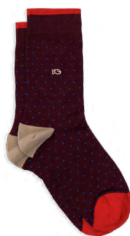
FA64 Wine red