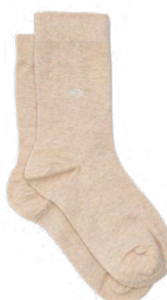
U29 Light beige