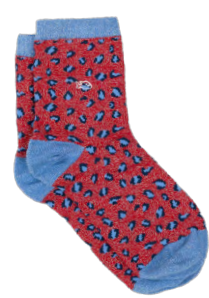
FFL20 Leopard, red