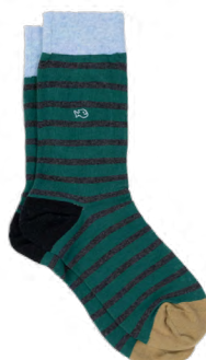
RL39 Dark green, grey striped