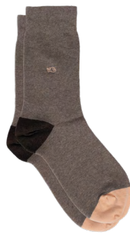
UF15 Mottled dark brown