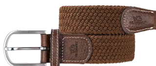
CM08 Camel brown