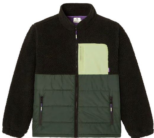
SHE25 Black and green