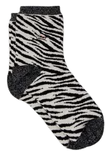
FFL09 Zebra, black and white