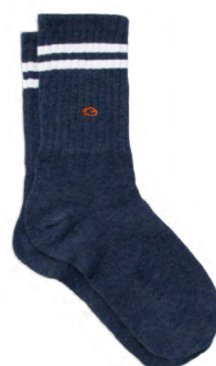
TE01 Blue, white striped