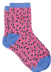
FFL25 Leopard, pink and blue