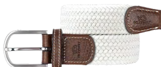
CM34 Coco white