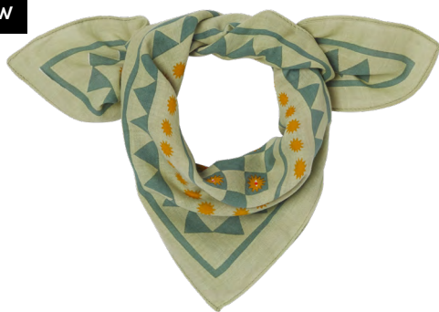
WBC06 Romane - Green