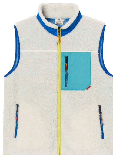
SHE34 Ivory and blue