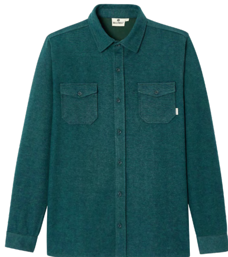
SUR05 Dark green