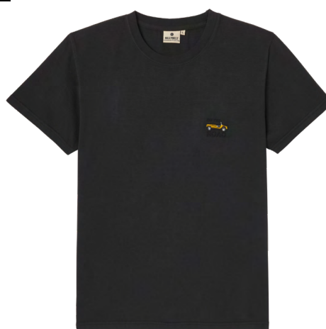
TSR06 Black, Mehari embroidery