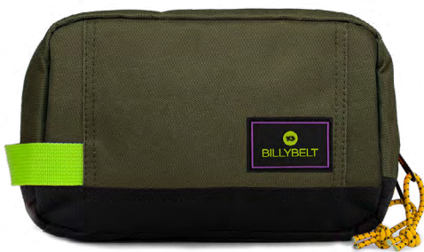
TDT14 Khaki and black