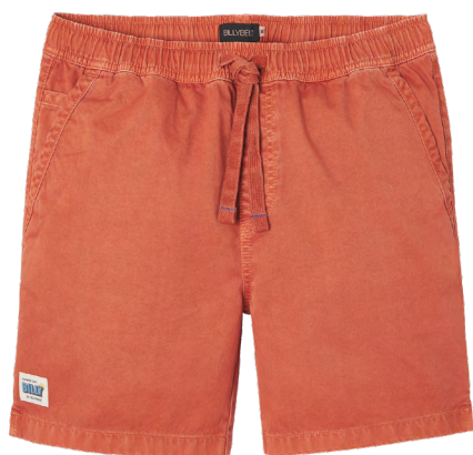
SHC05 Brick red