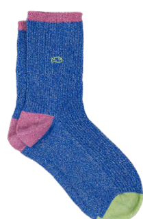
FPA20 Electric blue