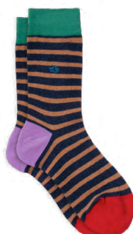
RL28 Navy, beige striped