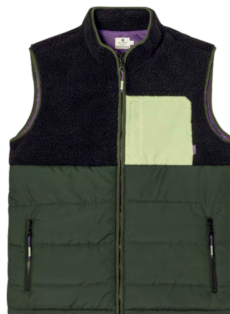
SHE21 Black and green