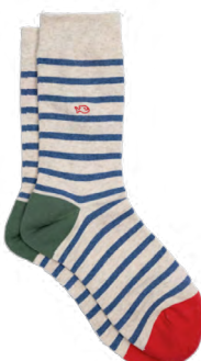
RL32 Beige, blue striped