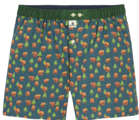
CA105 Brown bear