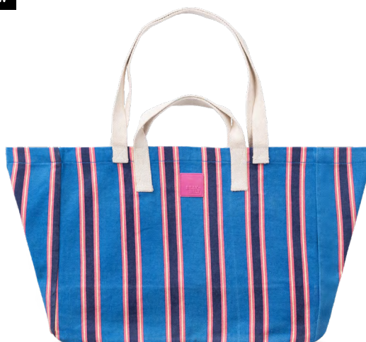
CAB04 Striped, blue