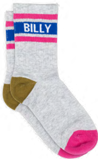
FTE08 Light heather grey and blue