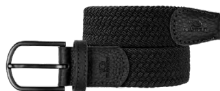
CM67 All black