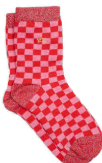
FM003 Red and pink