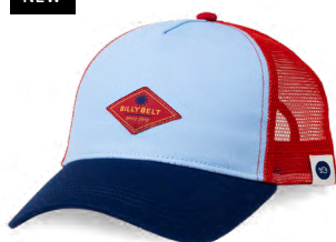
CAT03 Blue and red