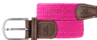
CM13 Fuschia pink