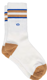
TE29 White, orange and blue striped