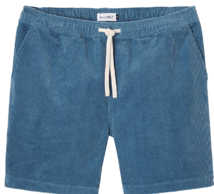
SHV10 Denim blue