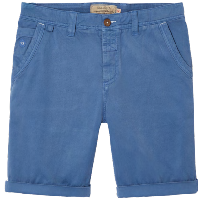
SH008 Light blue