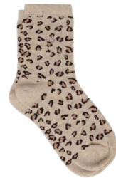
CLF01 Leopard, beige