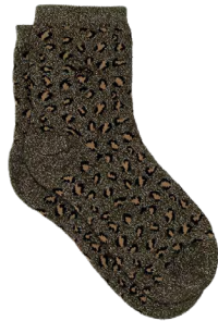
FFL02 Leopard, khaki