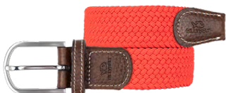
CM94 Cherry tomato