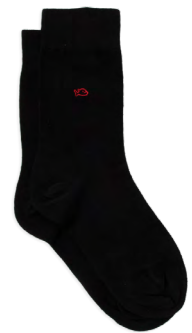
U02 Black licorice