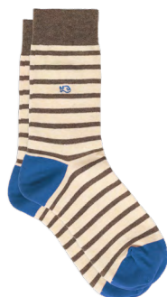
RL46 Beige, brown striped