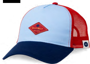
CTK03 Blue and red