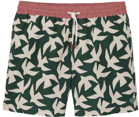
MDB15 Savage coast