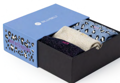
CCFO3 Dive into nature