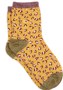
FFL18 Leopard, yellow