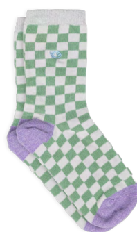
FM025 Green and white