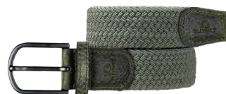
CM69 Dark forest