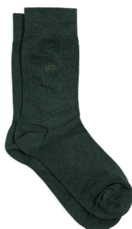
CBA08 Dark green