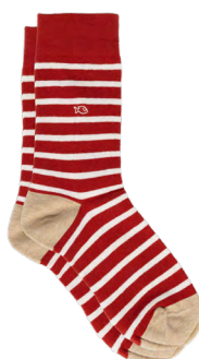
RL44 Red, beige striped