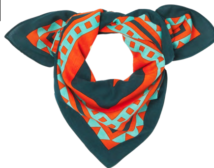
WBC03 Paola - Orange