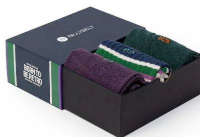
CCH03 Born to be retro