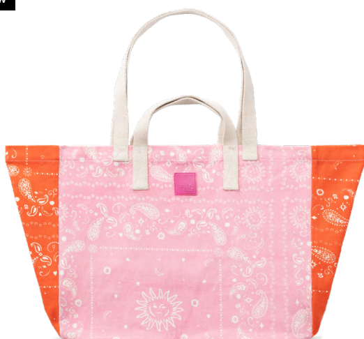
CAB03 Bandana print, multico