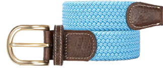
CF26 Sky blue