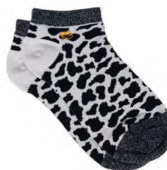
SFW21 Cow, black and white