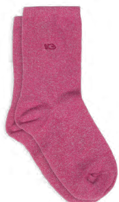
CP34 Neon pink