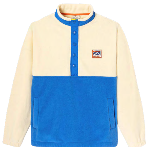
POLO1 White and blue