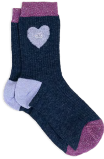
FC15 Navy and lilac