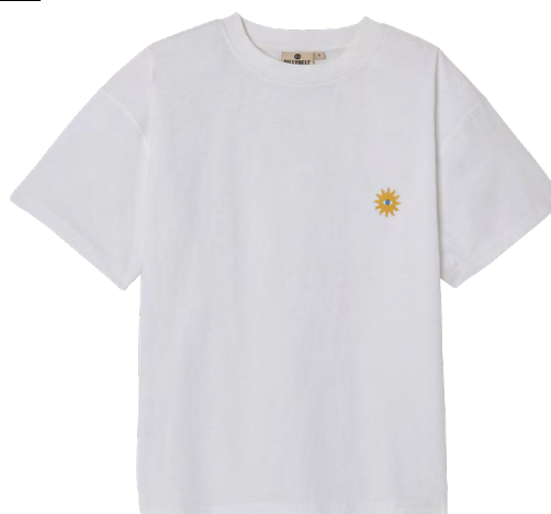
TSW01 White, sun embroidery