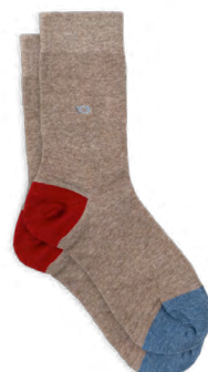
UF12 Mottled brown