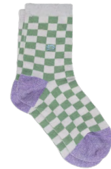
CKF01 White and green