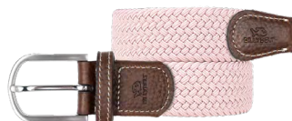
CM93 Old pink