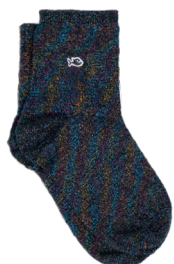
CP28 Black multico