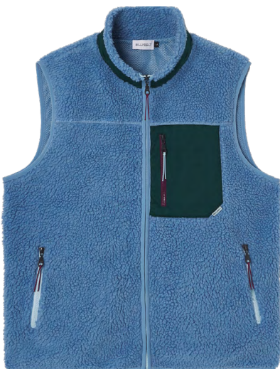
SHE46 Blue and green