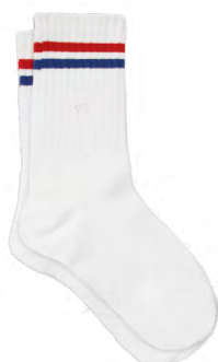
TE06 White, red and blue striped