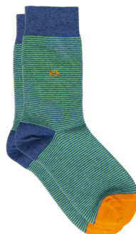
RA74 Garden party