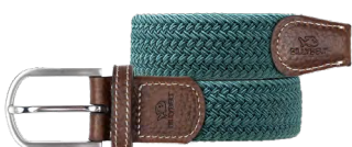
CM82 Green pine