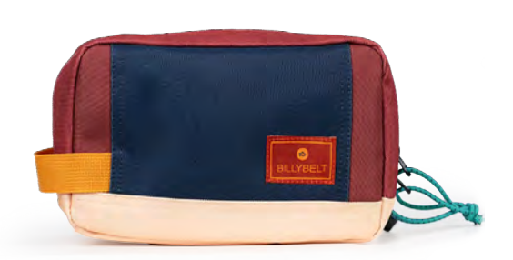
TDT17 Navy and burgundy