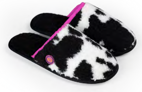
MUL14 Cow sherpa