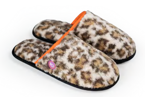
MUL15 Leopard sherpa