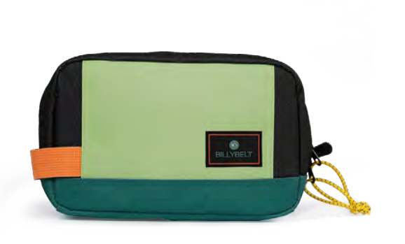
TDT14 Green and black