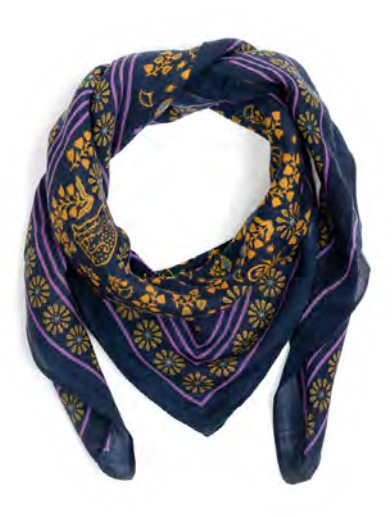
WFL11 Constance - Navy