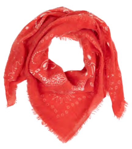
WBL01 Alice - Red