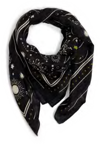
WFL09 Madeleine - Black