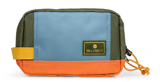
TDT18 Blue and khaki