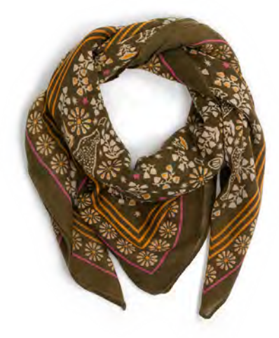
WFL12 Constance - Kakhi