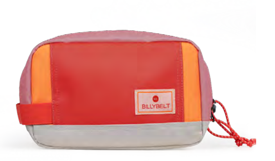
TDT15 Red and pink