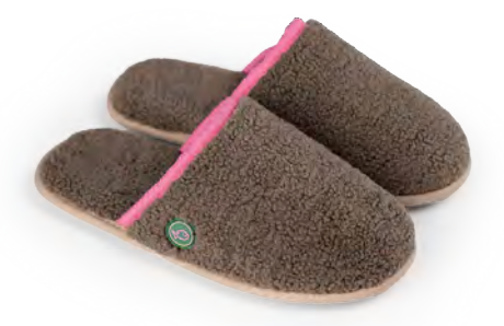
MUL13 Brown sherpa