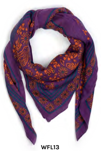
Constance - Plum