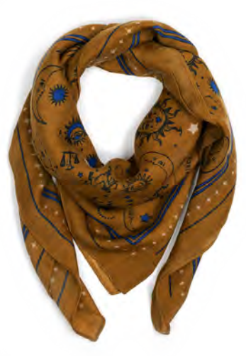
WFL10 Madeleine - Olive