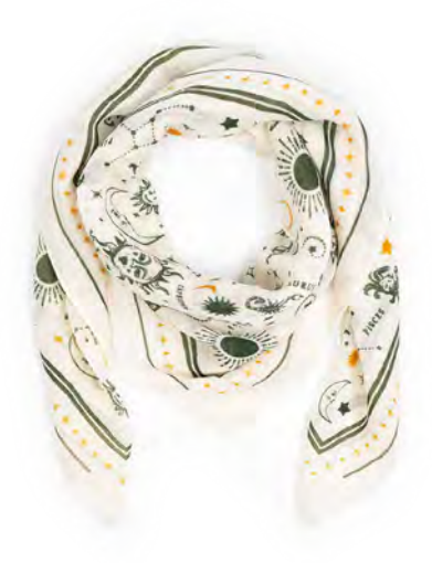
WFL08 Madeleine - Ecru