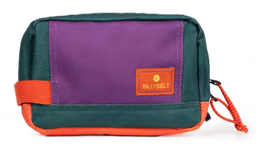
TDT16 Purple and green