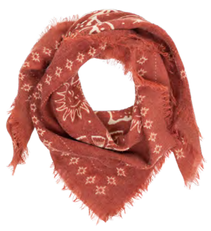
WBL04 Sasha - Terracotta