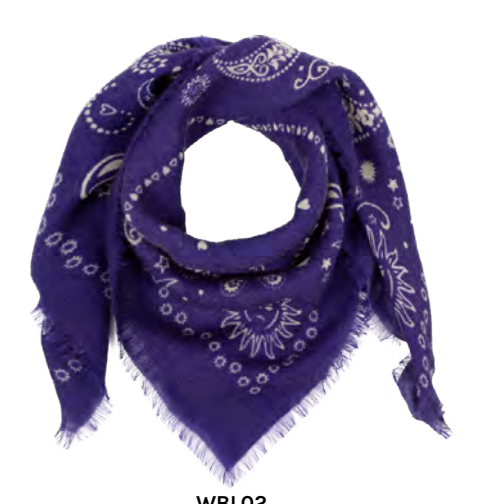
WBL02 Alice - Purple