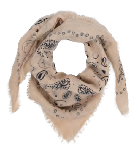
WBL03 Alice - Ecru