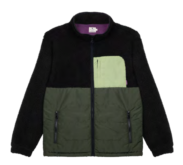
SHE25 Black and green