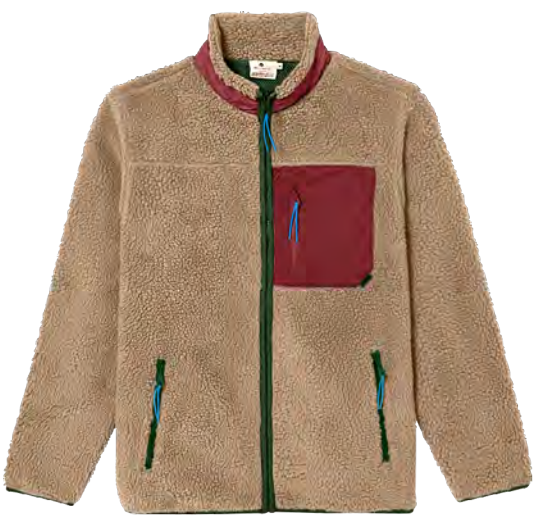
SHE39 Natural and burgundy