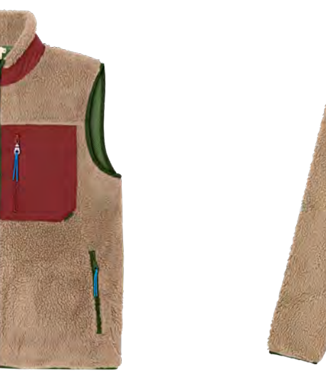
SHE36 Natural and burgundy