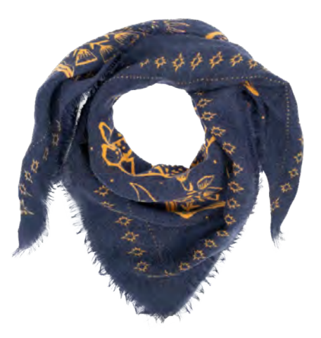
WBLO5 Sasha - Navy