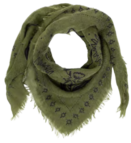
WBLO6 Sasha - Khaki