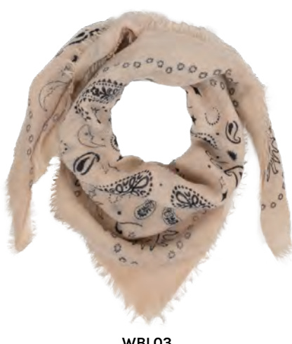
WBLO3 Alice - Ecru