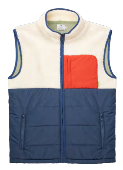
SHE22 Ivory and navy