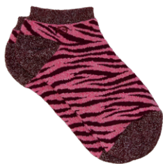
SFW05 Zebra pink