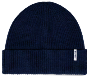
BEA14 Deep blue