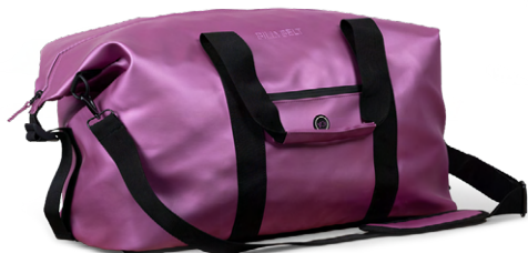
DUF04 Metallic pink