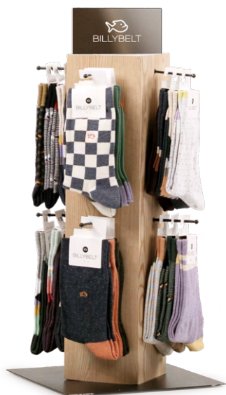
PRE07 Socks display Dimensions 57 x 30 x 30 cm