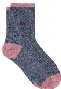
FPA11 Blue grey