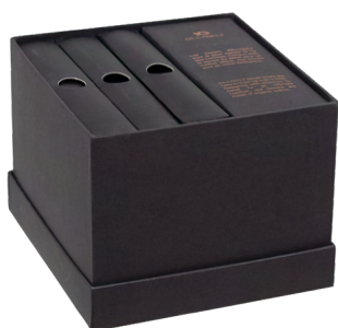
BX3B01 Box of 3 boxers briefs