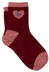
FC04 Red and pink