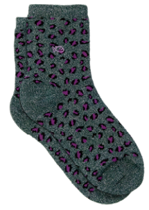
FFL15 Fir green