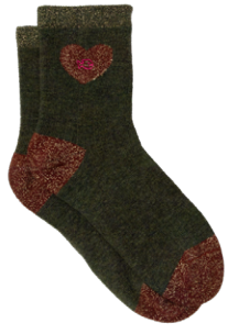
FC01 Khaki and burgundy