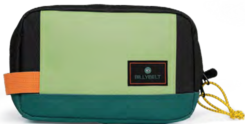
TDT14 Green and black