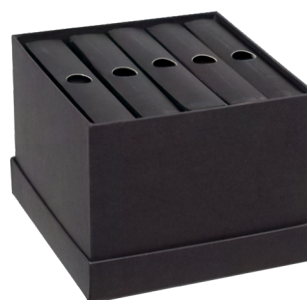
BX5B01 Box of 5 boxers briefs