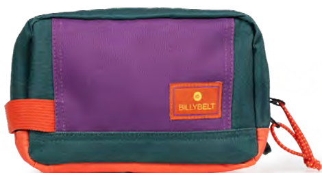
TDT16 Purple and green