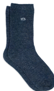
FLA10 Mottled blue