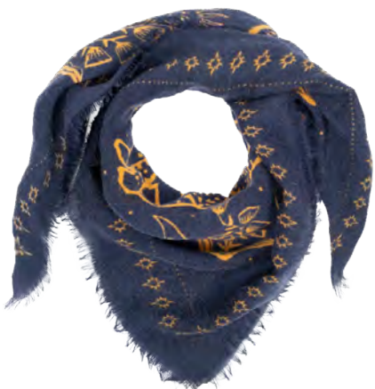
WBL05 Sasha - Navy