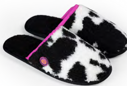
MUL14 Cow sherpa