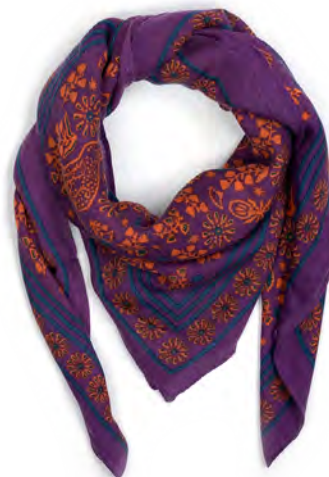
WFL13 Constance - Plum