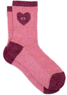
FC10 Light pink and pink