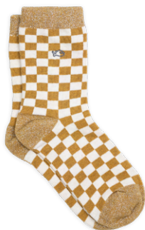
FMO04 Yellow and white