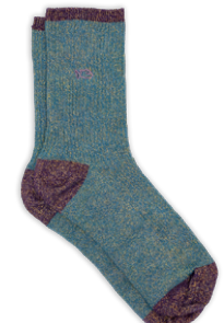
FPA17 Duck blue