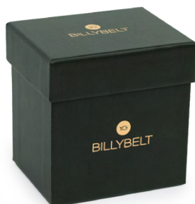
BXD012 Dark green duo box Dimensions 110 x 104 x 84 mm