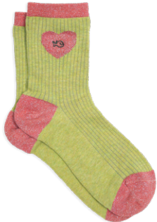
FC07 Olive green and pink