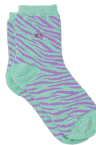
FFL11 Light green