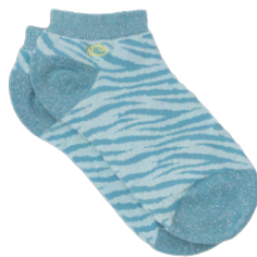
SFW06 Zebra blue