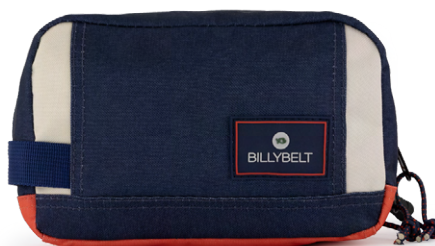
TDT07 Navy and ivory