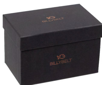
BXS01 Small weekpack (3)