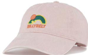
CAC08 Old pink