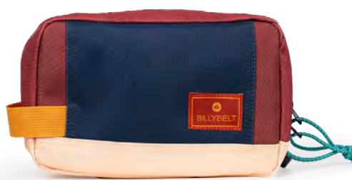
TDT17 Navy and burgundy