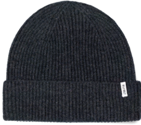
BEA01 Dark grey