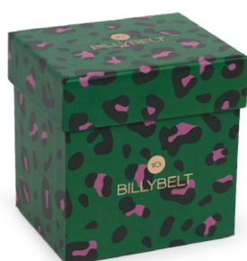
BXD015 Leopard duo box Dimensions 110 x 104 x 84 mm