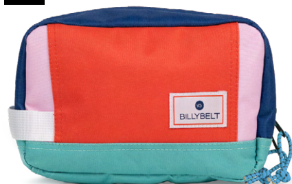
TDT13 Red and blue