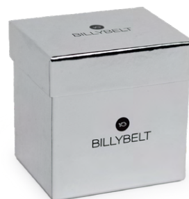
BXD014 Silver duo box Dimensions 110 x 104 x 84 mm