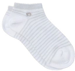
SRW01 White, silver striped