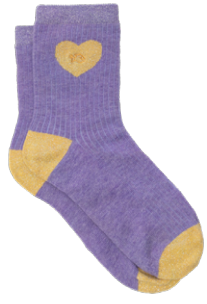
FC02 Purple and yellow