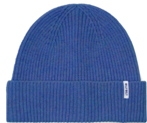
BEA21 Blue jean