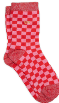
FMO03 Red and pink