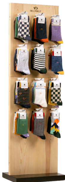
PRE08 Socks or boxer briefs display Dimensions 153 x 57 x 35 cm