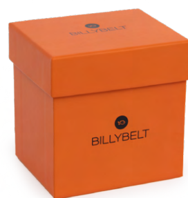
BXD011 Orange duo box Dimensions 110 x 104 x 84 mm