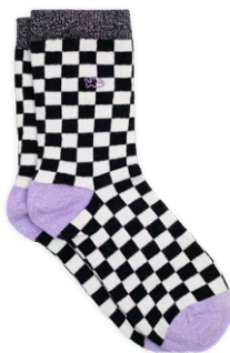
FMO02 White and black