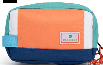
TDT12 Orange and green