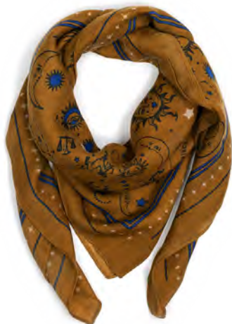
WFL10 Madeleine - Olive