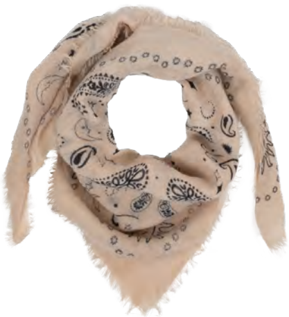
WBL03 Alice - Ecreu