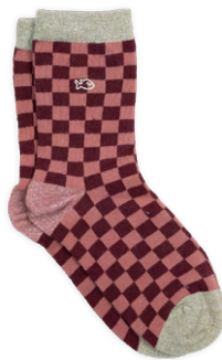
FMO05 Burgundy and pink