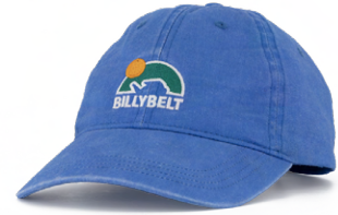
CAC03 Light blue