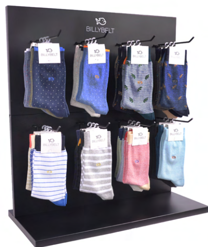
PRE03 Boxer briefs or socks display