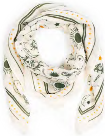
WFL08 Madeleine - Ecrú