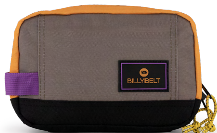
TDT08 Taupe and orange