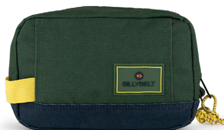
TDT05 Green and navy