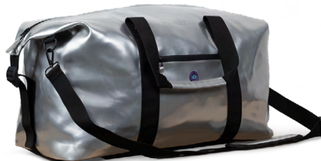
DUF03 Silver grey