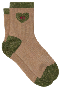
FC06 Beige and green