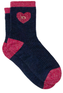
FC03 Navy and pink