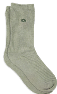
FLA12 Almond green