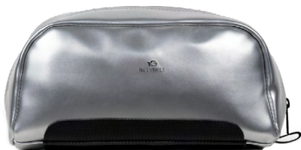
TDT09 Silver grey