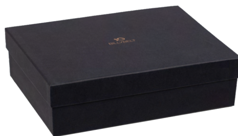
BX5C01 Box of 5 or 6 boxers shorts