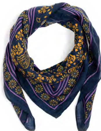
WFL11 Constance - Navy