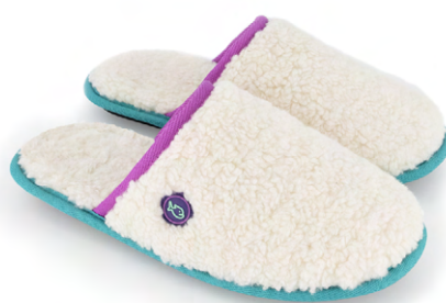
MUL09 Purple sherpa