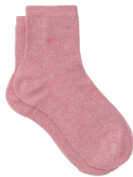
CP15 Peach pink