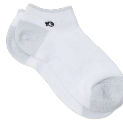
SP01 White and silver