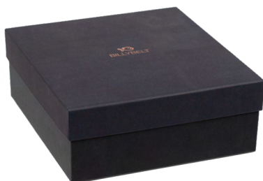
BX3C01 Box of 3 or 4 boxers shorts