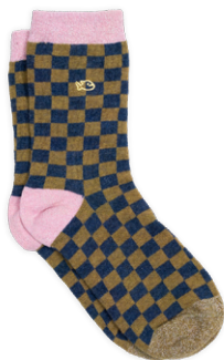
FMO01 Khaki and blue