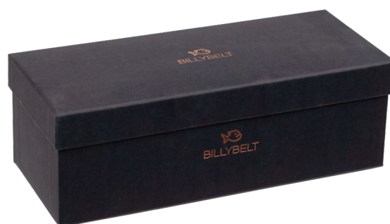
BXGS01 Large weekpack (4)