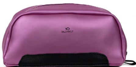
TDT10 Metallic pink