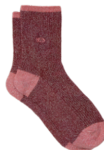
FPA12 Dark pink