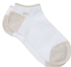
SP10 White and gold