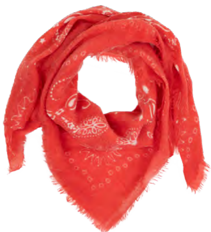
WBL01 Alice - Red