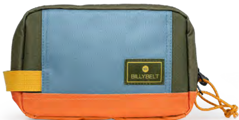
TDT18 Blue and khaki