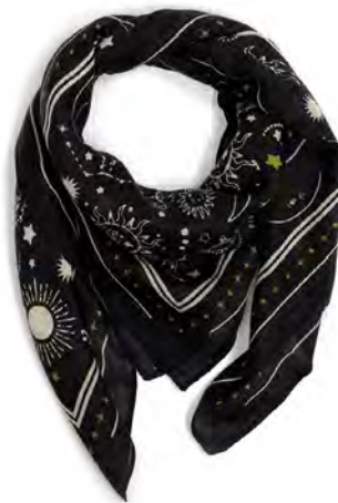
WFL09 Madeleine - Black