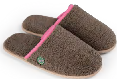
MUL13 Brown sherpa