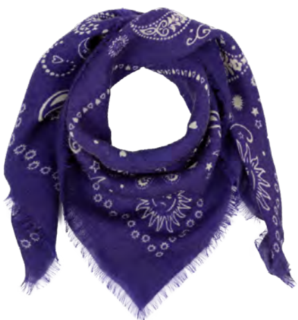
WBL02 Alice - Purple