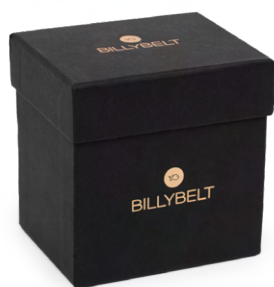
BXD001 Black duo box Dimensions 110 x 104 x 84 mm