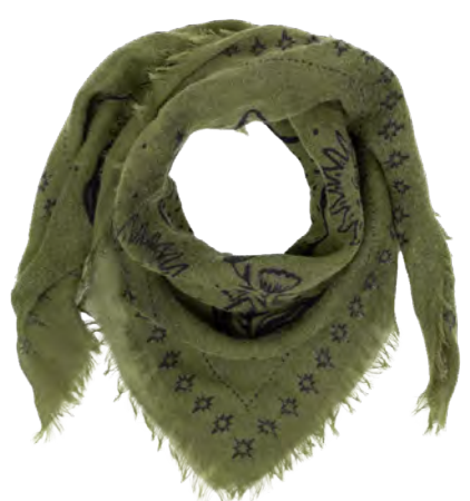
WBL06 Sasha - Khaki