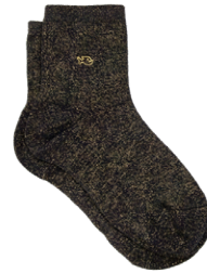
CP08 Mineral black