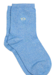
CP24 Light blue