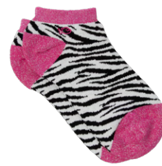
SFW04 Zebra white