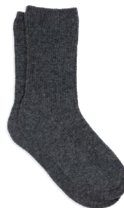
FLA05 Dark grey