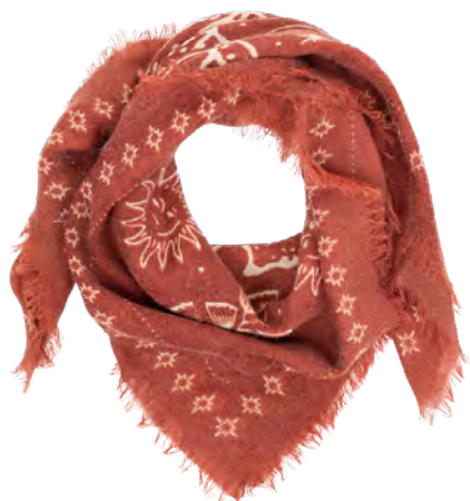
WBL04 Sasha - Terracotta