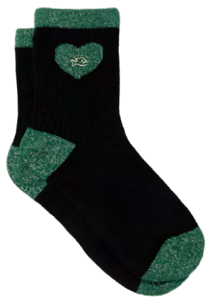
FC05 Black and green