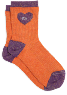
FC08 Orange and purple