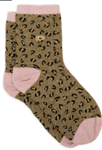
FFL17 Olive green