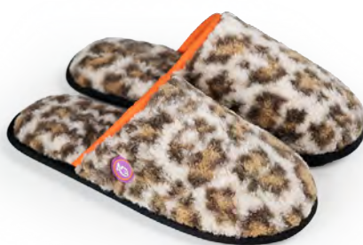
MUL15 Leopard sherpa