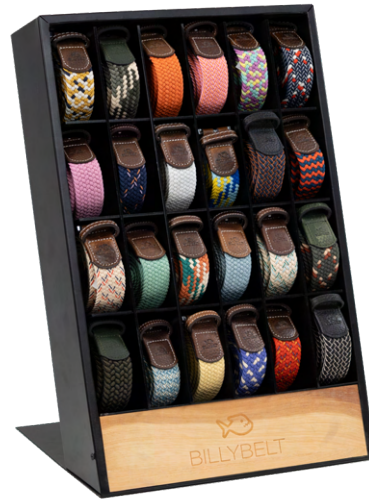
PRE01 Boxer shorts or belts display