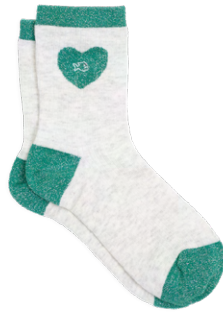
FC09 White and green