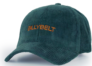
CAV09 Dark green