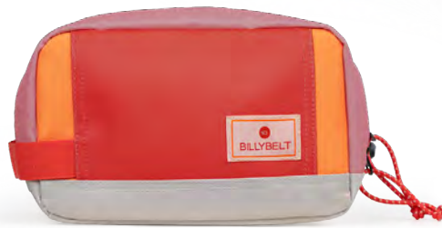
TDT15 Red and pink