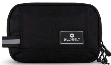
TDT04 Black stone