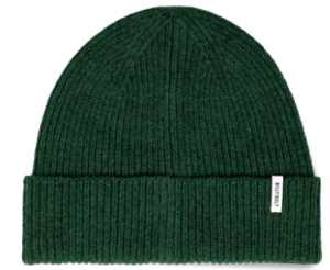
BEA16 English green