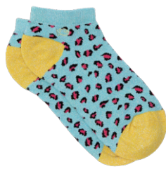
SFW03 Leopard blue