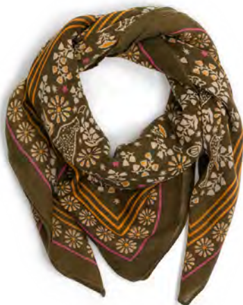
WFL12 Constance - Kakhi