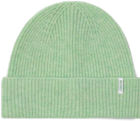
BEA06 Light green