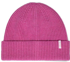
BEA17 Bubblegum pink