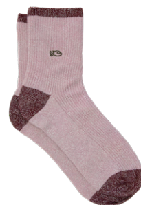
FPA04 Light pink